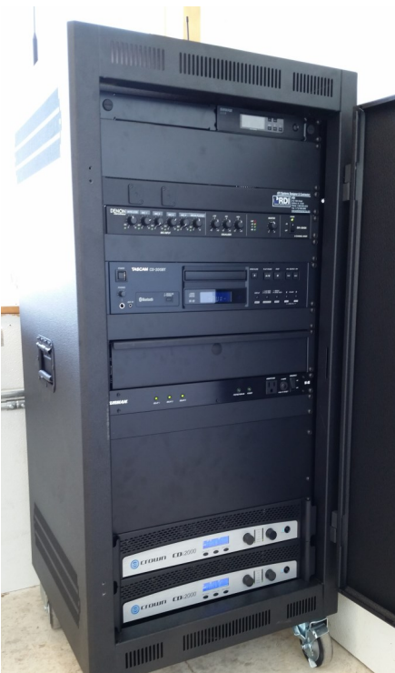
New Equipment Rack