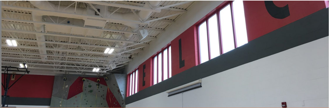
Estherville Lincoln Central Demoney Elementary Gymnasium