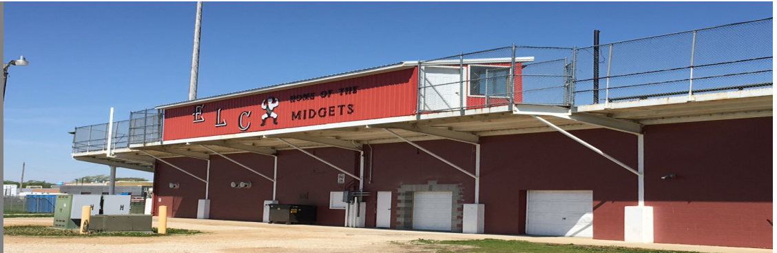
Estherville Lincoln Central High School Hoyt Luithly Field