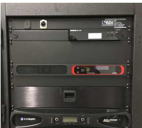
New Equipment Rack